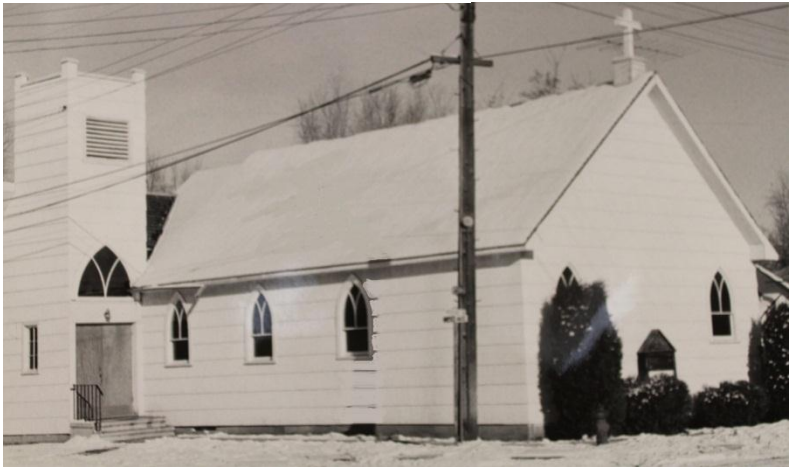
Zion after 1959, remodeled